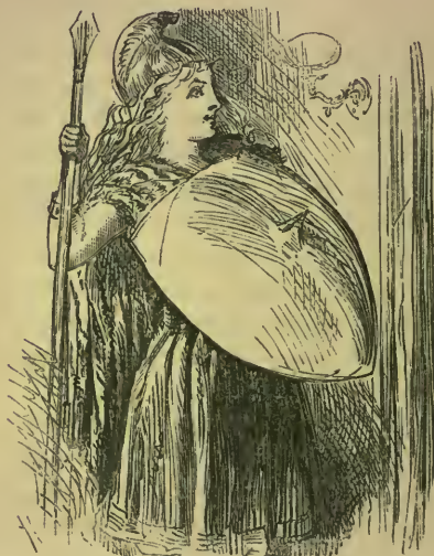
CHRISTIE AS QUEEN OF THE AMAZONS.

your neck, or pick your way like a cat in wet weather, but come with effect , for I want that scene to make a hit."